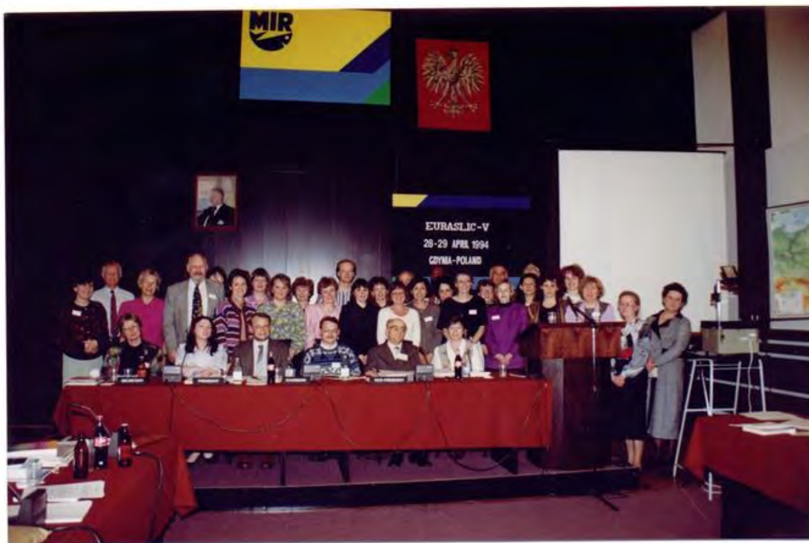
Photo 1. EURASLIC V, Gdynia, 1994