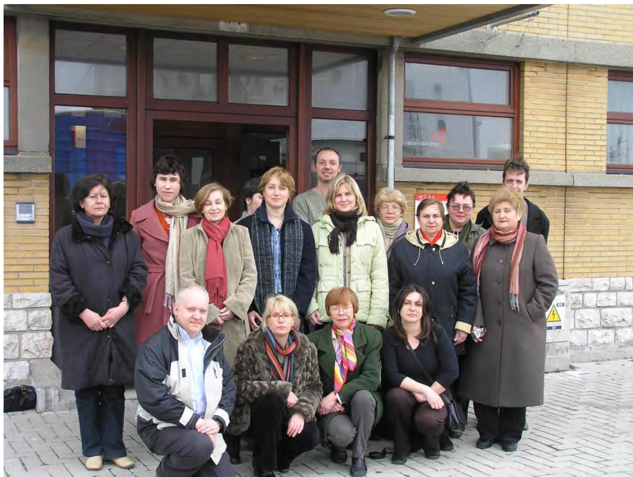
Photo 8. Participants of the first ODINECET MIM Training in 2006 in Oostende, Belgium