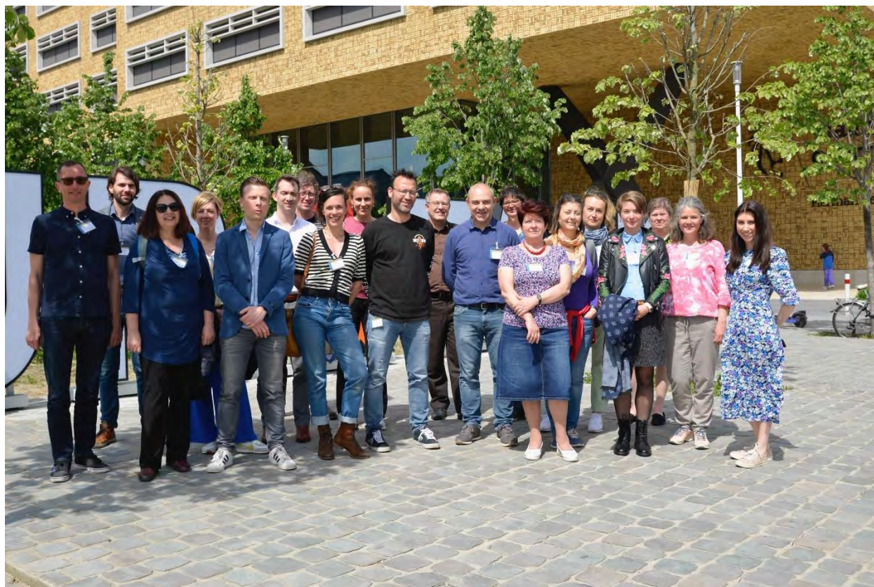
Photo 7. EURASLIC XX, Brussels, 2023.

workshop new records were created and the best ones won prizes. The workshop was followed by a presentation on AquaDocs. Open Science was also the topic of the poster by Flanders Hydraulics Research speaking on optimising research data, and their disclosure and visibility through an expert platform, while the other poster brought light on the history of fake news. BIOR was represented by an institutional report. The field trip to The Research Centre for Aquatic Fauna in Linkebeek informed participants about monitoring and restoration activities for saving aquatic fauna species.