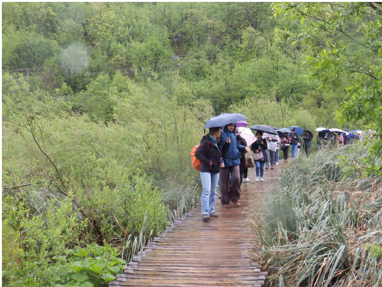
Photo 5. Walking in the rain - Plitvice lakes - EURASLIC XVIII (2019)