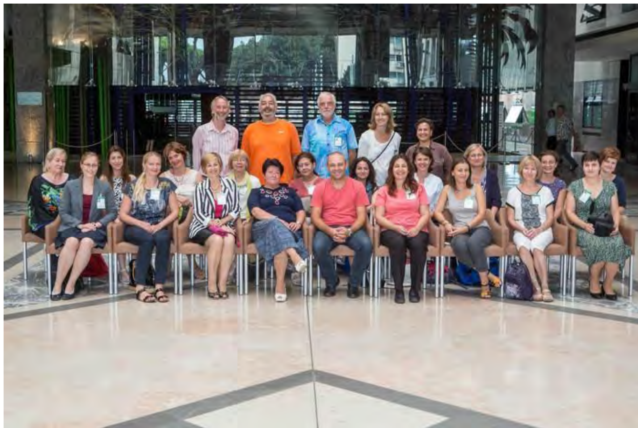
Photo 2. EURASLIC XVI, Rome 2015